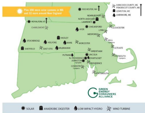
Resources that are part of the Green Energy Consumers Alliance portfolio.

Parish of the Epiphany runs on 100% fossil-free electricity today! For over 3 years, Parish of the Epiphany has sourced its electricity from WinPower 100 (the 100% renewable municipal electric aggregation program in Winchester).